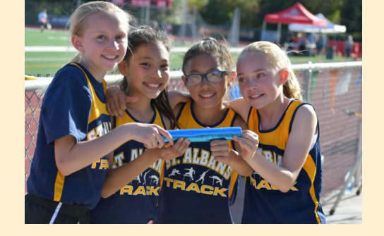
Fifth grade girls at Track & Field meet.