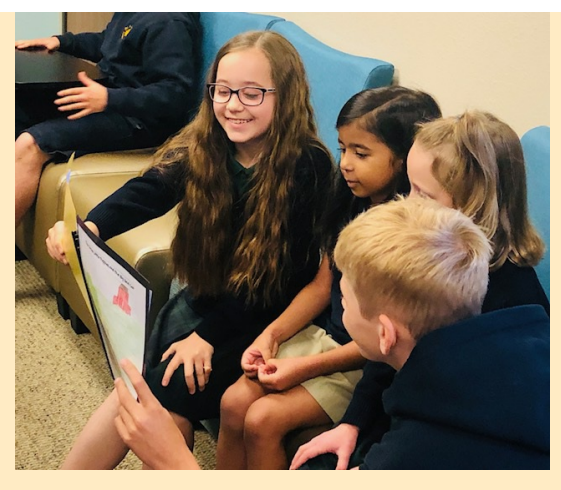
Fifth graders read storybooks they created in Library Class to their friends from kindergarten.